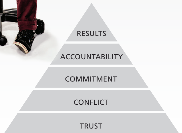
The Five Behaviors of a Cohesive Team Model